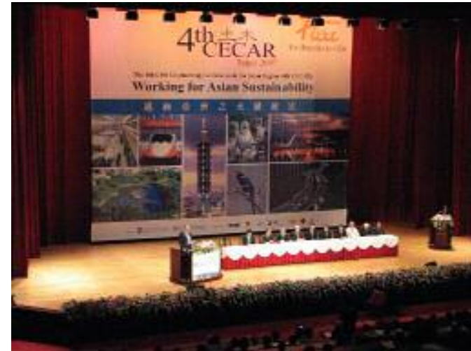
4 th CECAR on June 2007