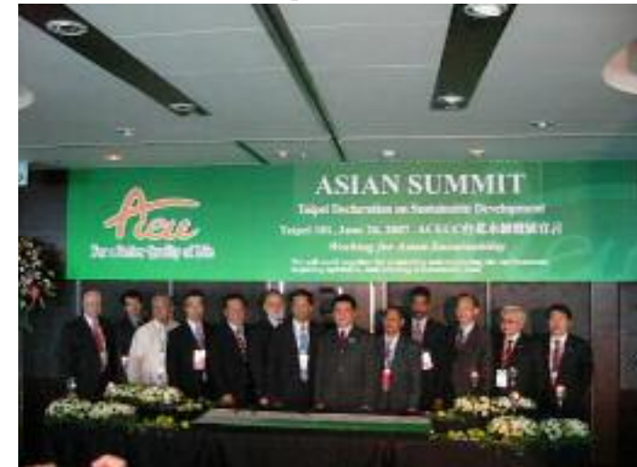
15 th ECM and Asian Summit at 4 th CECAR in 2007